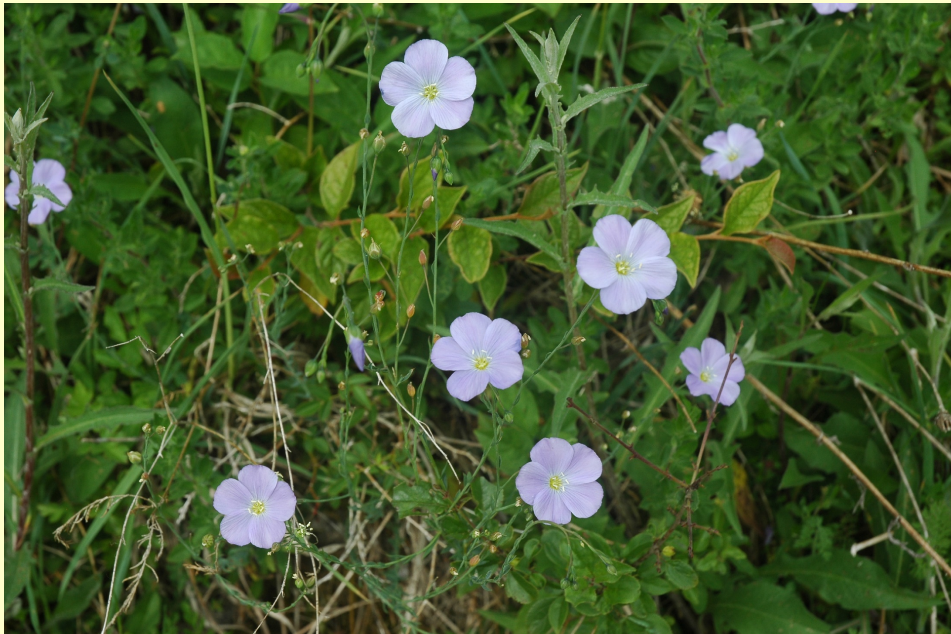
Linum perenne ( Perennial Flax ) Cherry Hinton, Cambridge