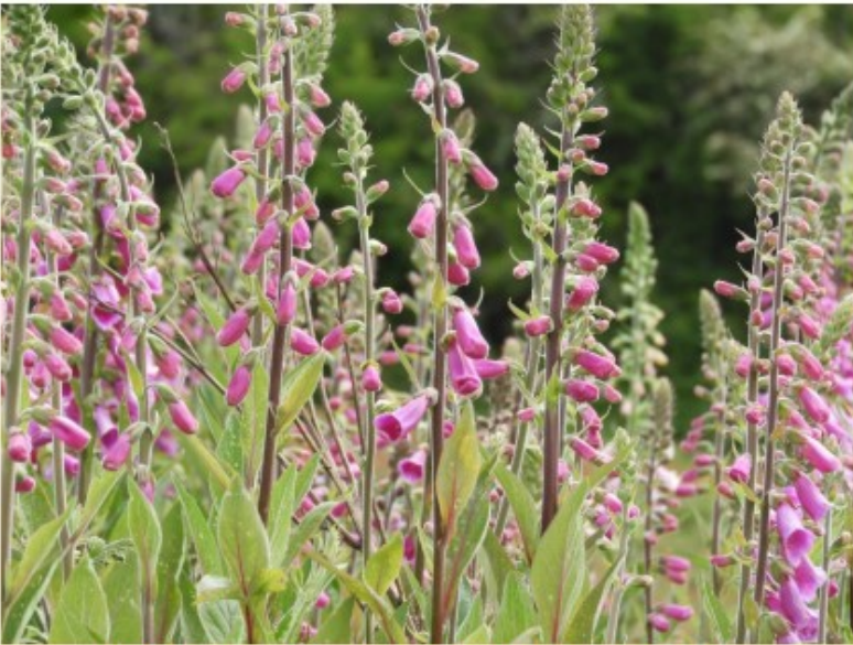
Digitalis purpurea (Foxglove), Newtimber Hill, Sussex (Sylvia Davidson)

As a new BSBI committee the CfE is still developing. Some of the things the Committee will do include: