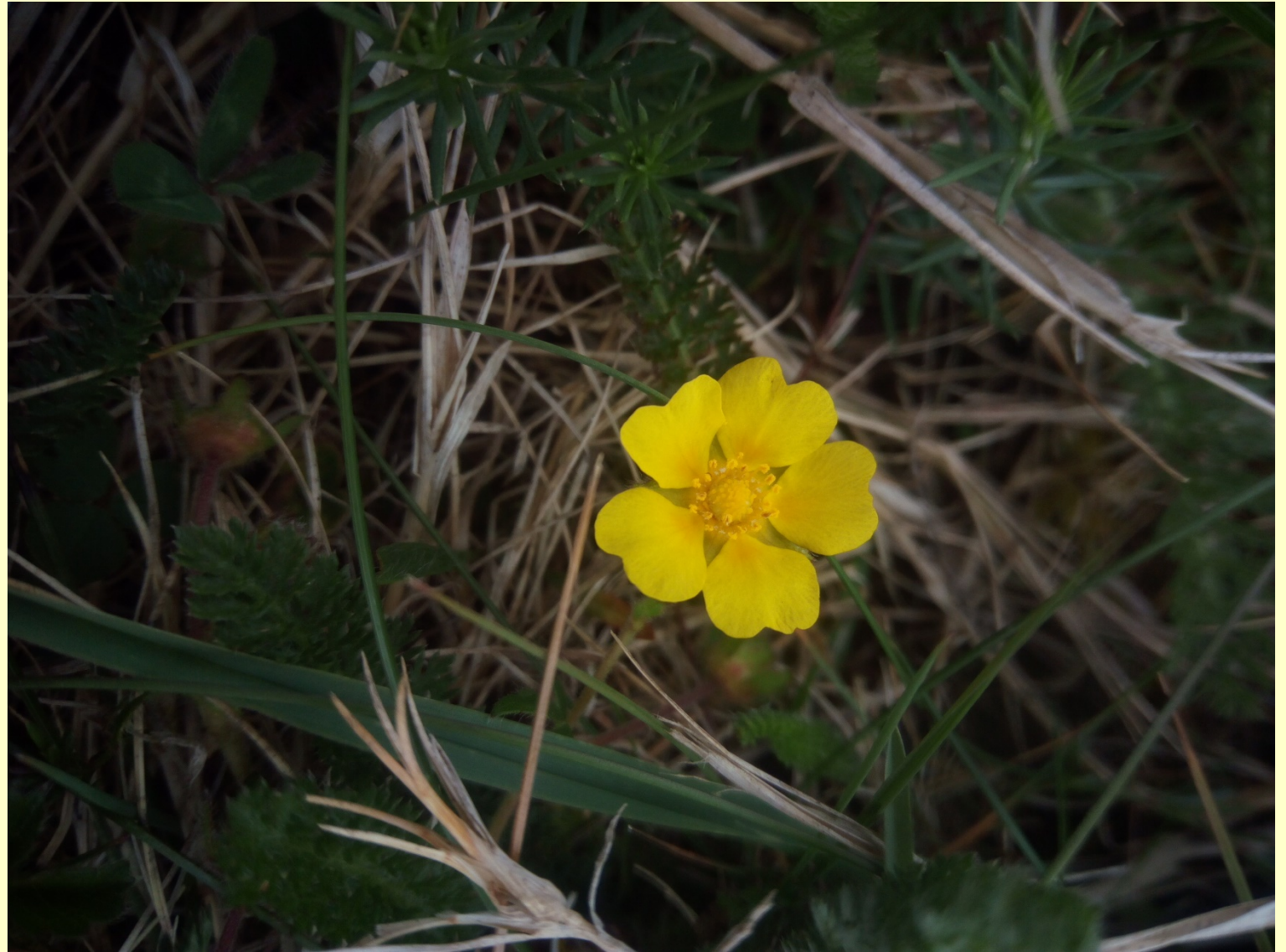
Potentilla verna ( Spring Cinquefoil ), present on Newmarket Heath, but “lost” from an adjacent hectad.

The Committee is considering drawing up a project to search for and record the habitats of “lost” notable species that haven’t been seen in a hectad for more than 20 years and compare that habitat with a location where the plant still grows. It will be launched at the England Annual Meeting next year.