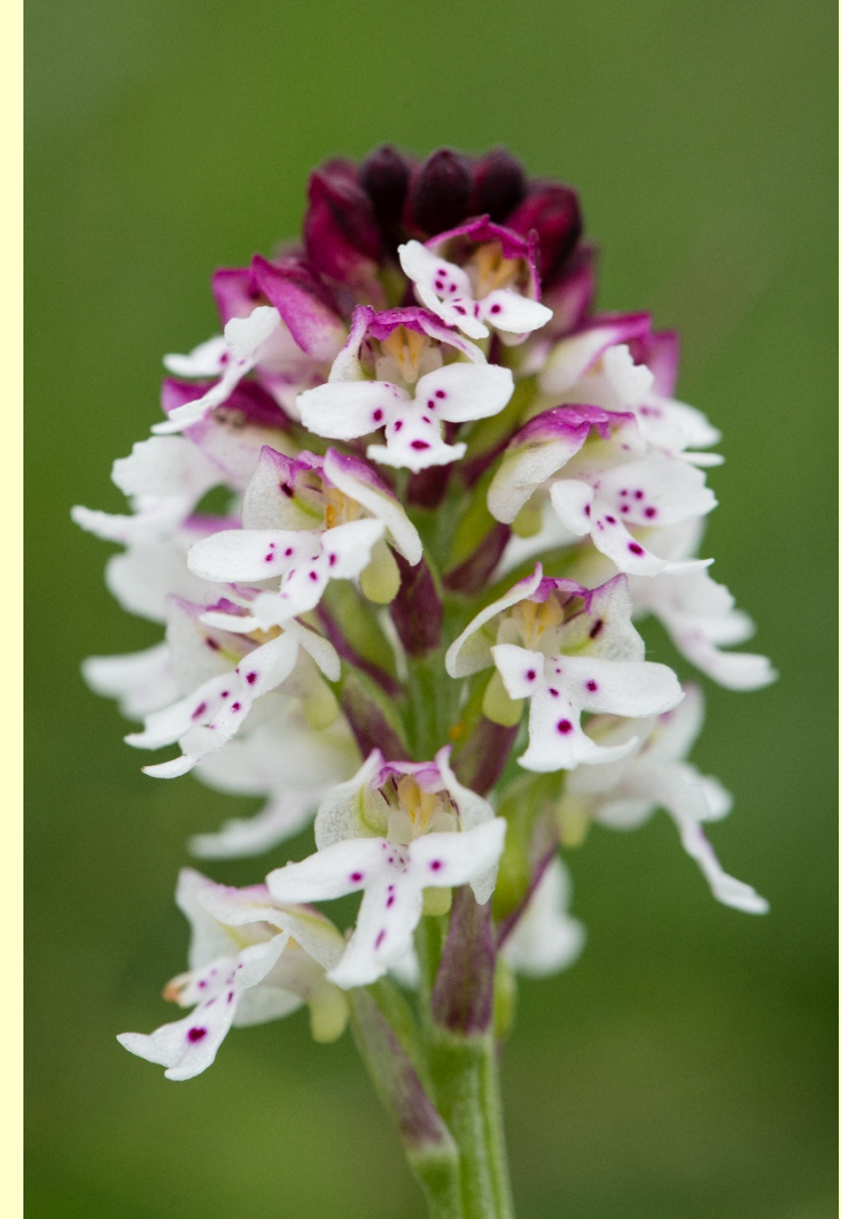
Neotinea ustulata ( Burnt Orchid), Knocking Hoe NNR, Bedfordshire