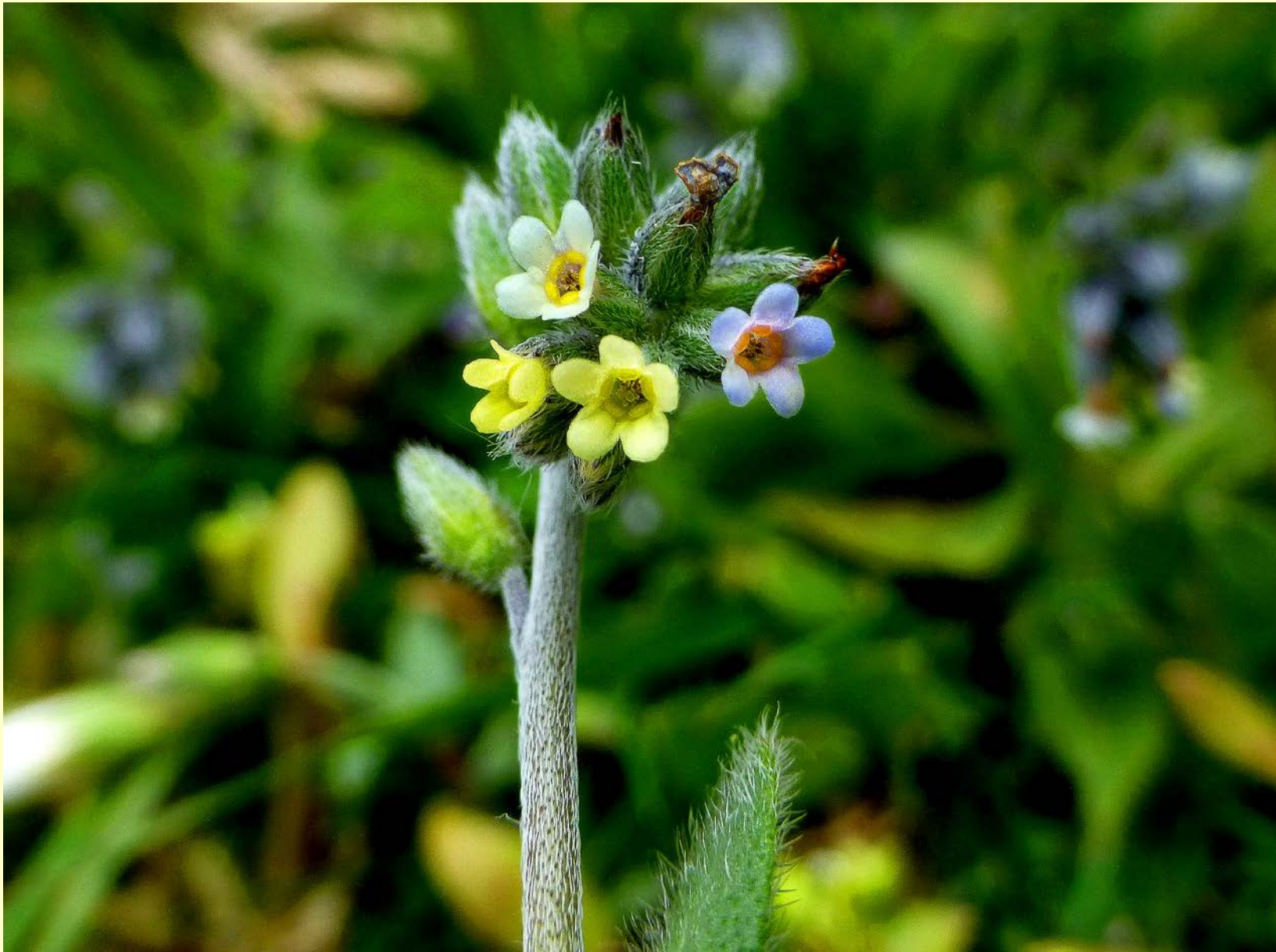
Myosotis discolor ( Changing Forget-me-not) at Maidscross Hill, Suffolk

You could help – would you like to join the Committee ?