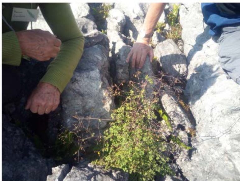
Thalictrum minus (Lesser Meadow-rue) in limestone pavement at the Malham Tarn ASM

Some of the things the Committee will do