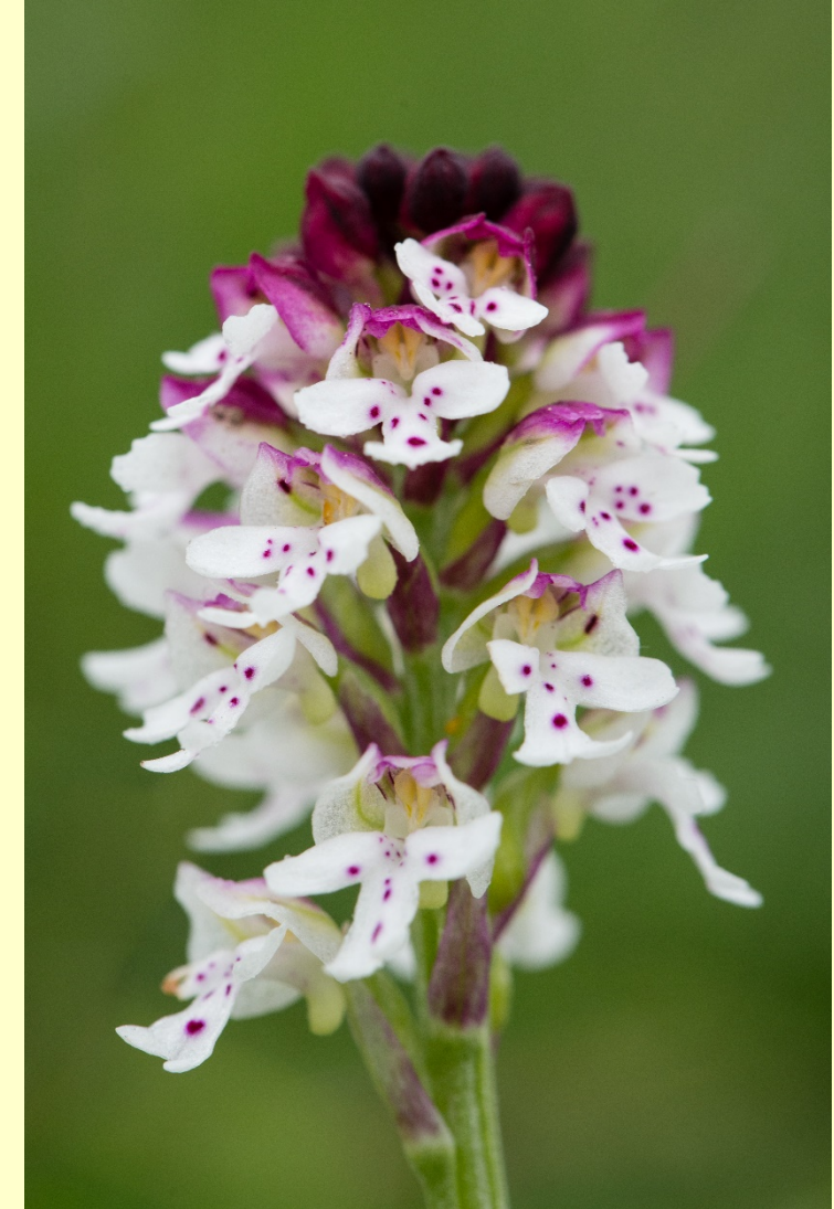
Neotinea ustulata ( Burnt Orchid), Knocking Hoe NNR, Bedfordshire